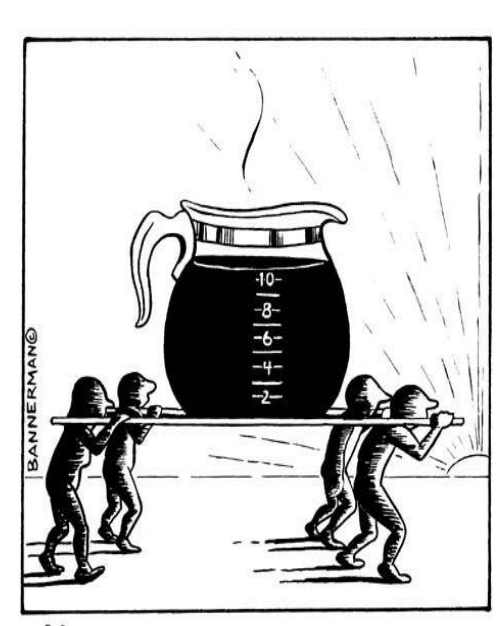
Hi-Ho, Hi-Ho, it's off to work we go.