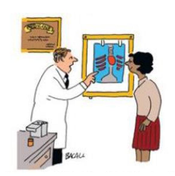
"Your heart is slightly bigger than the average human heart, but that's because you're a teacher."